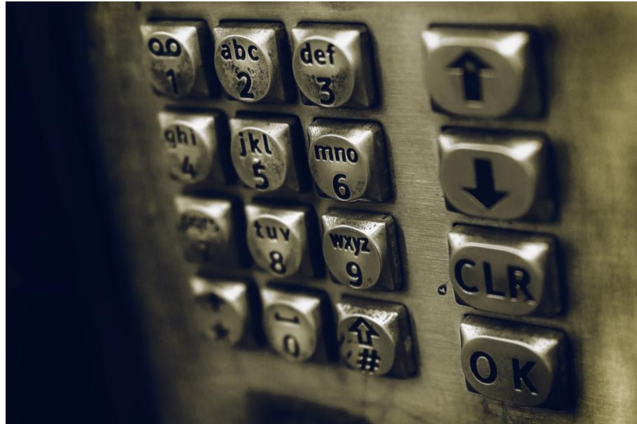
Figure 4 James Sutton on Unsplash

Companies, like Google and Apple, are starting to develop more and more smart home devices. As they do, an increasing amount of consumers will